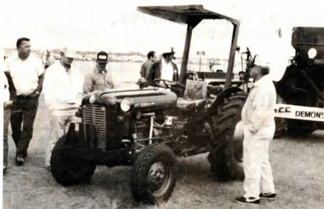
Model 539, same as the old MF135, has hydraulics, 3-pt. and dual pto.

For more information, contact: FARM SHOW Followup, Steve Seymour, Rt. 1, Calhoun, Ky. 42327 (ph 502 273-5083).