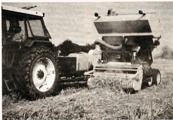
Mobile processor, powered by its own engine, cubes 5 tons per hr.