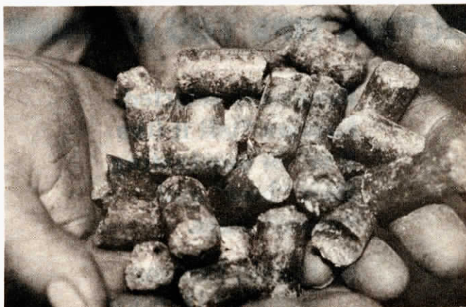
Used as fuel, the 3/4 in. dia. straw cubes have 70% the energy value of coal.