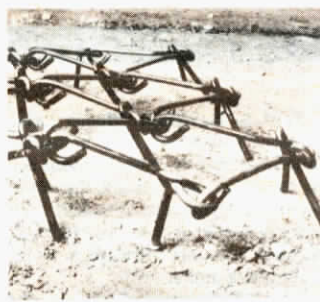
Specially designed 7/16 in. steel tines are 3.5 in. long.

Conservation tillage — One pass with a Fuerst harrow in tandem with a disk, field cultivator or chisel plow breaks up clods, levels and sifts soil granules downward, preparing a seedbed that helps trigger earlier germination. "I've found that the harrow corrects a lot of mistakes the drill