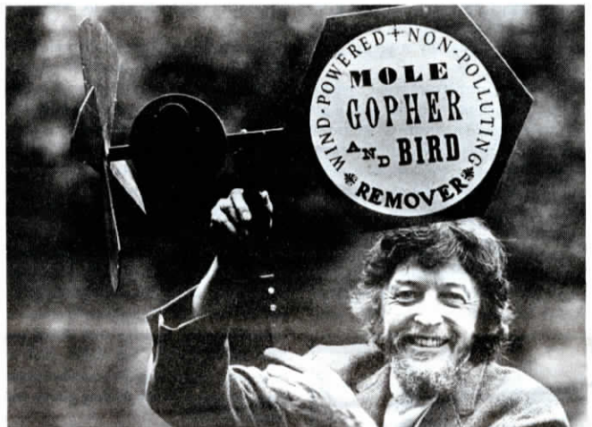
Wind-driven propeller strums a length of music wire attached to a circular sound board. The musical "bongs" scare gophers and moles away.