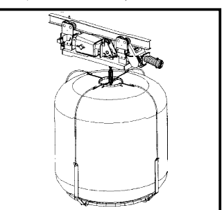
The feeder handles up to 5 by 6-ft. bales.

Contact: FARM SHOW Followup, Diamond Hooftrimming, Box 111, Diamond City, Alberta, Canada TOK 0TO (ph 403 381-3352; fax 403 320-6463).