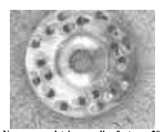
New powered trimmer disc features 20 teeth for smooth operation.