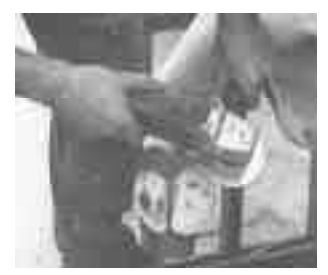
Blade fits any 4 1/2 to 5-in. right angle grinder.