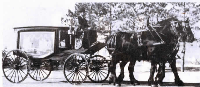
Coach is fitted with solid rubber outer wheel rims for silent operation.