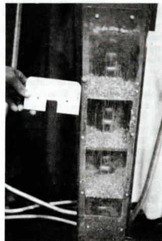
Plastic paddles simply bolt in place of rubber paddles on combine clean grain elevator.

For more information, contact: FARM SHOW Followup, Kuchar Sales, P.O. Box 595, Carlinville, Ill. 62626 (ph 217 854-9838).