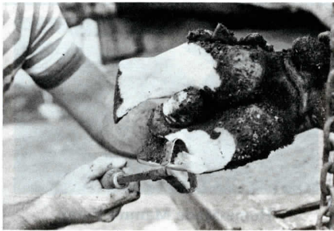
Triangular-shaped knife trims hooves in half the time.