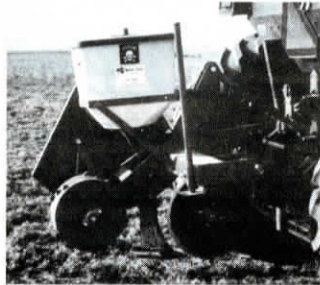
Gopher killer digs artificial tunnels that intercept gophers' runways. A 20-in. dia. coultter is mounted in front of steel shank, with poison delivered underground out back of shank.

"The coultter has self-aligning bearings instead of bushings so it won't bend. It digs as deep as the hoe drill point to keep it from digging up dirt and makes an incision so slight that the machine is recommended for