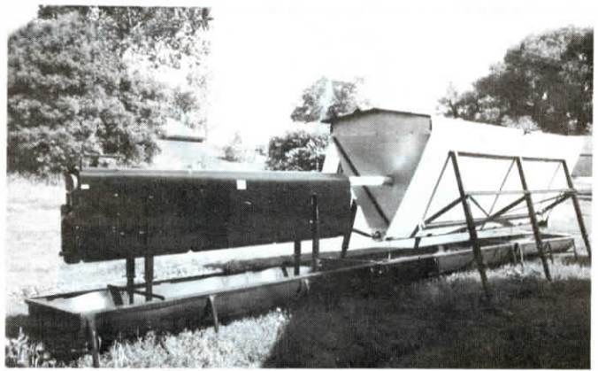
Steel hopper is equipped with timer, allowing feed to be discharged at predetermined intervals. For increased capacity 10-ft. long extensions can be coupled to hopper.