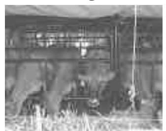
Milking units raise so cows can enter.

The unit is hydraulically raised to 18 in.