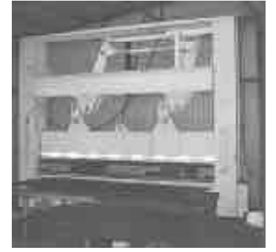
Horizontally mounted cylinder provides 5:1 mechanical advantage.