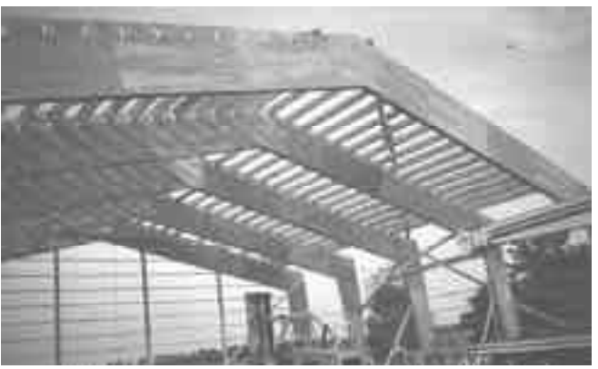
Eagle's wood frame buildings with no trusses boast many advantages over steel frame buildings, including leaving no place for pest birds to land on.

Contact: FARM SHOW Followup, Bruce Meidinger, Eagle Rigid Spans, Inc., 3113 E. Broadway, Bismarck, N.Dak. 50501 (ph 800 279-7726 or 701 224-1877).