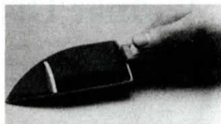
Dispenser works great to evenly dole out tiny, hard-to-handle garden seeds.