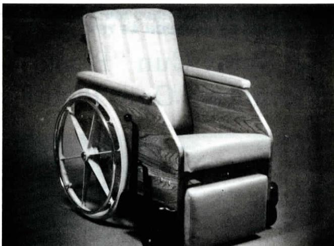
WheelLounge's seat, back and armrests can be adjusted for rider comfort.

For more information, contact: FARM SHOW Followup, Morton Rachofsky, 2300 Mercantile Bank Building, Dallas, Texas 75201 (ph 214 747-8188).