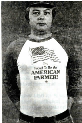
The "I'm Proud To Be An American Farmer" message is imprinted in red and blue letters on a white background. Available in athletic-styled jerseys or T-shirts.

For more details, contact: FARM SHOW Followup, Flor Art Studio, 7101 York Ave., Minneapolis, Minn. 55435 (ph 612 831-3333).