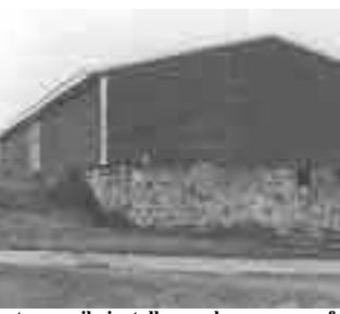
high, risky roof portion. It's then a simple job for the owner to complete the disman-, tling project himself.

Cleaner capacity depends on the crop and the type of cleaning operation. It will be on the market by fall. The U.S. and Canadian distributor is Silverthorn Seeds Ltd. in Outlook, Sask. at ph 306 856-4532. (Harvey