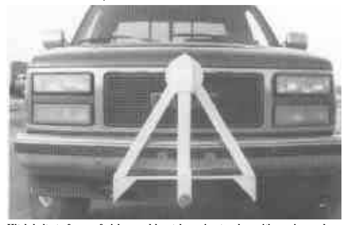
Hitch bolts to frame of pickup and has telescoping tow bar with maximum draw weight of 6,000 lbs. When not used for towing, it folds up flat against front of pickup.

Contact: FARM SHOW Followup, Steve Rash, 1074 Jessup Ave., Union Iowa, 50258 (ph 515 486-5527) or Brad Cruse, 1712 Bishop Ave., Plainfield, Iowa 50666 (ph 319 276-3172).