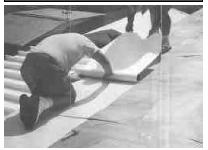
You apply the self-adhering, aluminum-faced roll roof material by peeling off the paper backing and sticking it down to any clean, dry surface, including old asphalt.

Contact: FARM SHOW Followup, Roger Sutton, 275 Millington Rd., Fostoria, Mich. 48435 (ph 517 795-2771).