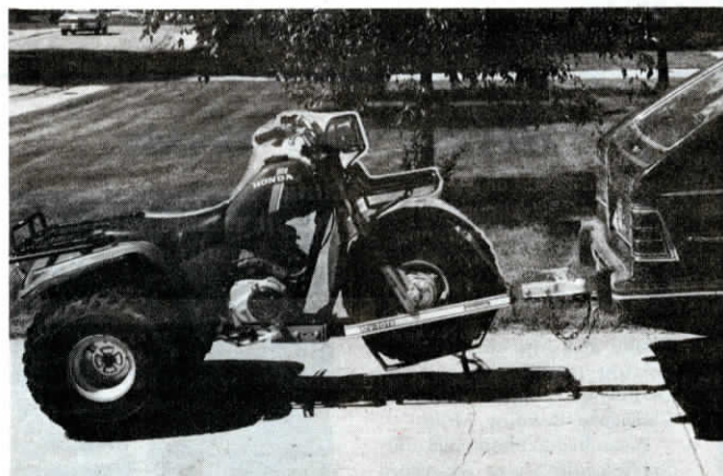
ATV front wheel straps into hitch cradle which easily detaches upon arrival.

For more details, including availability of the new product in your area, contact: FARM SHOW Followup, Protein Technology Inc., Suite 1350, 701 Fourth Avenue So., Minneapolis, Minn. 55415 (ph toll free 800 654-3839; in Minnesota, call 612 339-6936).