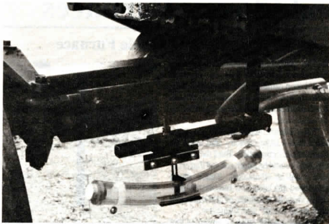
Tractor operator simply keeps rolling steel ball directly over the row to keep cultivator in line.