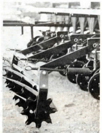
Ber-Vac rolling harrow “won't plug in heavy trash and mounts close to the implement without interfering with turning”.

The rollers on both single and double units are equipped with hand-adjust tension