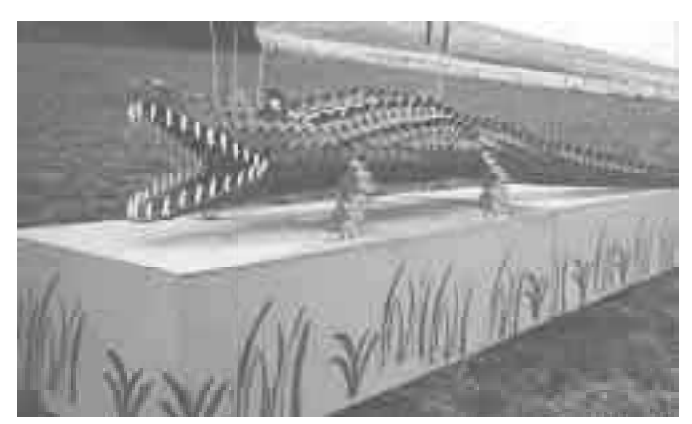
The alligator is 15 ft. long and 14 in. wide. It's constructed of 1,100 sickle sections.