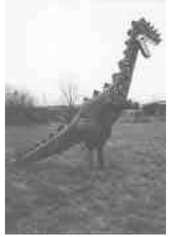
Dinosaur made of 1,854 sickle sections.

The alligator was built in two weeks last October. It's 15 ft. long by 22 in. wide and is constructed of 1,100 sickle sections. Its teeth are rotary hoe teeth instead of sickle