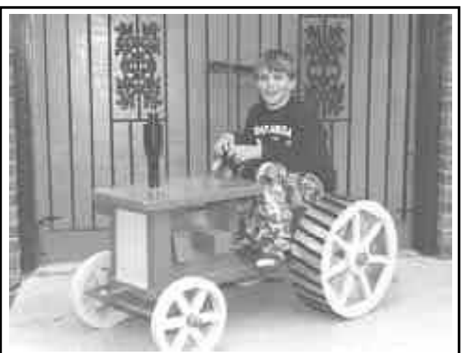
Wooden tractor made to look like a Deere steel-wheeled model.

Contact: FARM SHOW Followup, Hy Goldenberg, 3008 E. Stone Ledge Blvd., Huntington, Ind. 46750 (ph 219 356-5595).