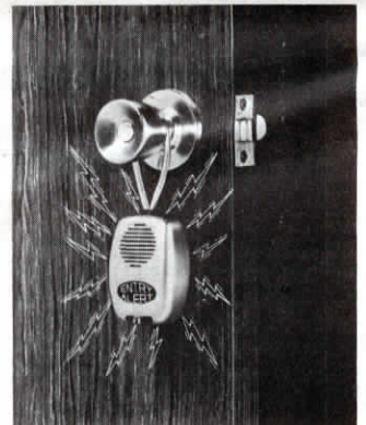
Door knob alarm sounds when a potential burglar touches outside knob.

To operate, you simply turn it on and hang it on the inside door knob. The unit then takes about 40 seconds to activate and create its detection field. During this time, you can walk out the door and lock it behind you. Upon returning home, the alarm is activated but the door can be opened quickly, allowing you to reach around in seconds and turn the alarm