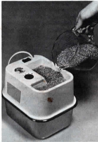
Electric Magic Mill "explodes" your homegrown grains into tasty, nutritious flour.

The Magic Mill II weighs 8 lbs. and is about the size of a large toaster. The milling chamber is self-cleaning and the stainless steel flour pan and impact-resistant plastic hopper require just a wipe with a damp cloth. Retail for $279.50.