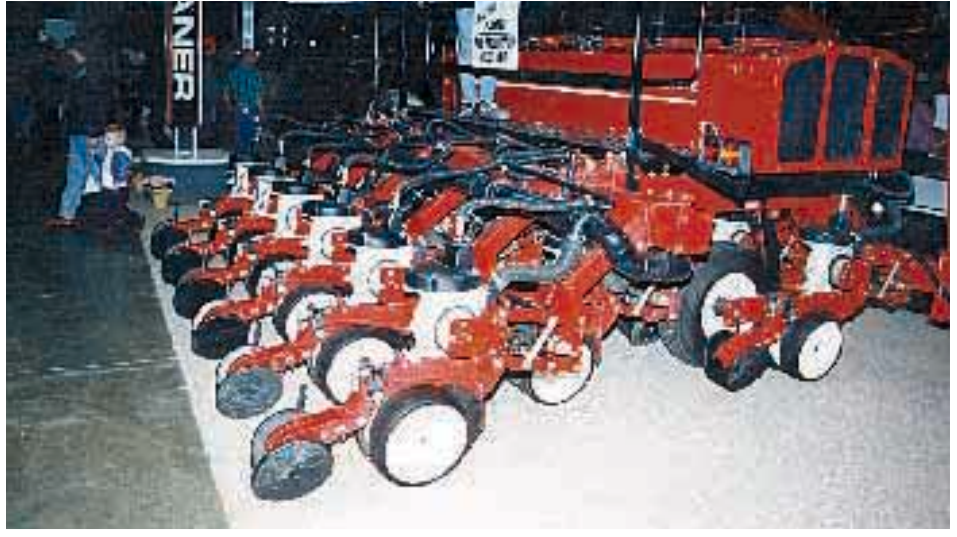
There are three rows of planter units on the new AGCO air planter. Both back rows can be removed to switch from 10-in. spacing to 30-in.