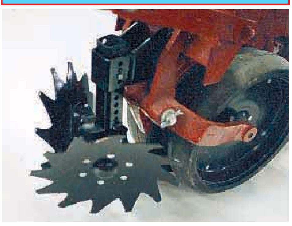
Row cleaning wheels have a concave shape and are equipped with slanted teeth that brush heavy trash out of the way.

Contact: FARM SHOW Followup, Grease Buster, T-J Tools, 5565 Lytle Road, P.O. Box 120, Waynesville, Ohio 45068 (ph 513 897-5142).