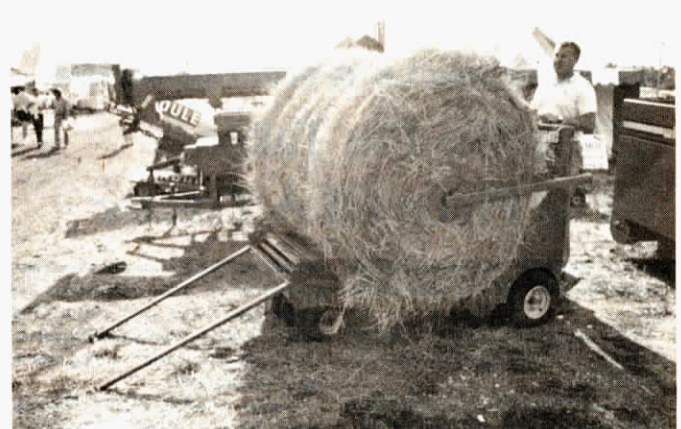
Operator winches bale up onto unloader using two steel ramps. The unloader is powered by an 8 hp. motor and has a ride-along platform at rear.

For more information, contact: FARM SHOW Followup, Montezuma Welding & Mfg., Rt. 1, Box 40B, Montezuma, Kan. 67867 (ph 316 846-2482).