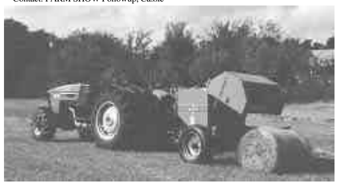
Mini baler makes 3-ft. wide, 2-ft. dia. bales. A 3-pt. hitch wrapper is also available.

Co. Mfg., 111 West Third St., Argyle, Minn. 56713 (ph 218 437-8329).