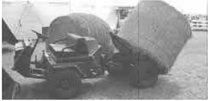
PUG ATV can be fitted with an add-on bale spear and hydraulic cylinder for hauling

Contact: FARM SHOW Followup, Husson Inc., 230 Old Pine Circle, Racine, Wis. 53402 (ph 414 681-1960).