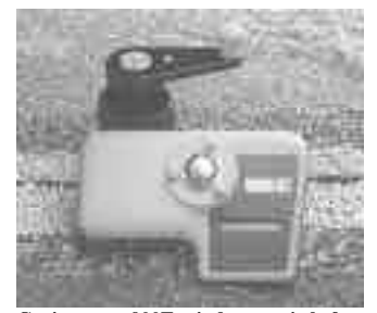
Grainmaster 900E grinds up grain before compressing it to take a reading.

The Protimeter Grainmaster 900E, sold by GSF Inc., Des Moines, Iowa, measures both moisture content and temperature. It grinds and compresses a sample inside a