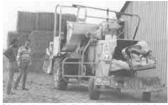
Drivers inspecting a race machine. More than 1,000 races have been held so far.

Contact: FARM SHOW Followup, Eric De Vos, 20 Rue Des Acacias, E8170 Serazereux, France.