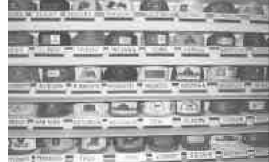
A few of Legried's Deere dealer caps from every state, including name, town, and state of the dealer it came from.