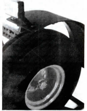
Fenders attach with two bolts to front axle bearing housing. They're strong enough to stand on and can be fitted with optional floodlights.

For more information, contact: FARM SHOW Followup, Midwest Fender and Supply, 104 Main St., Schaller, Iowa 51053 (ph 712 275-9910).