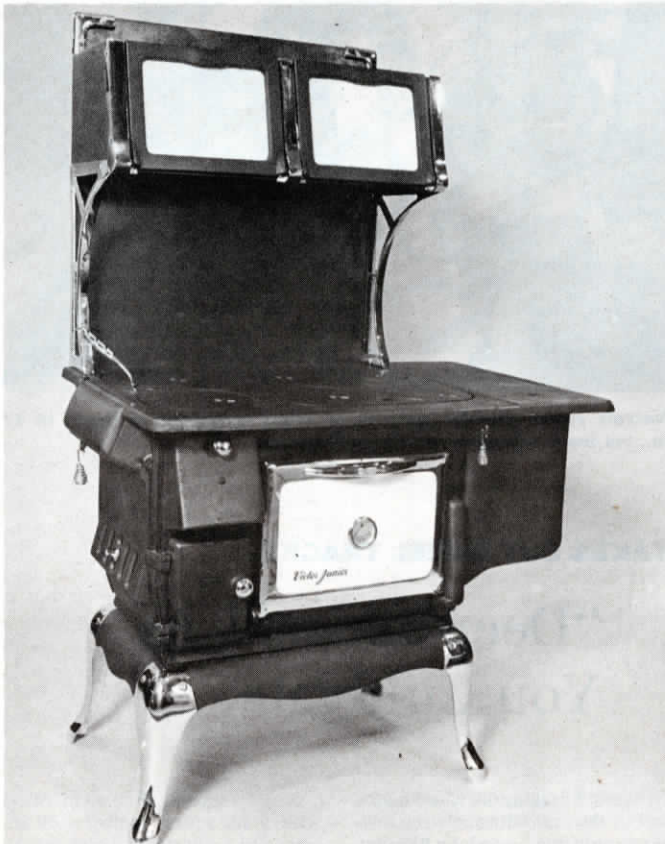
Originally designed in 1911, the "new" Victor Jr. wood range "will outlast and outperform most modern units," says the manufacturer. "It's still making cooks look good."

For more details, contact: FARM SHOW Followup, Pioneer Lamps and Stoves, 71 Yesler Way, Seattle, Wash. 98104 (ph. 206 622-4205).