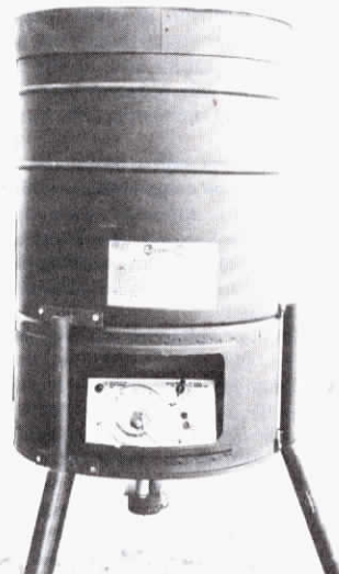
Battery-powered feeder works great in remote areas, says manufacturer, for automatic, periodic feeding of livestock, or deer and other wild animals.