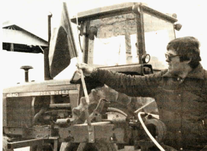
Flag slips into metal holder at outer edge of wide equipment.

For more information, contact: FARM SHOW Followup, S and S Distributors, Rt. 1, Box 79, Geneseo, Kan. 67444 (ph 316 824-6452).