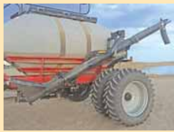
Before and after of damaged auger and repair. Repaired auger is still in use 10 years later.