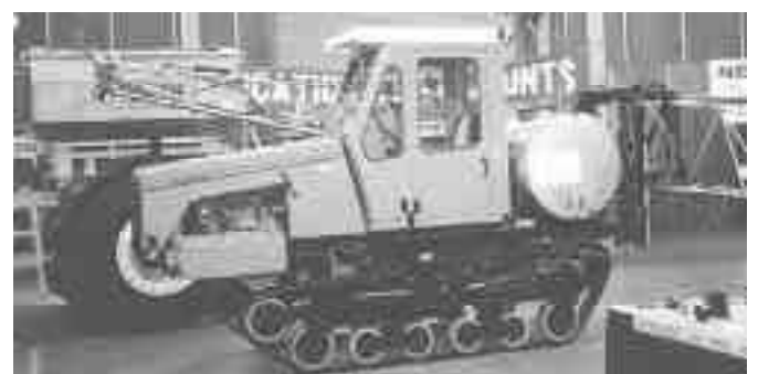
The Deere-powered TR2 Tracker is available with a number of options, including spray booms, pump and 250-gal. tank (as pictured).

Contact: FARM SHOW Followup, Omnitrac, 68287 Lower Cove Road, Cove, Ore. 97824 (ph 541 963-0139; fax 541 568-4571).