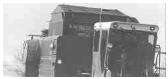
Electric tarp automatically puts tarp on combine grain tank when needed.