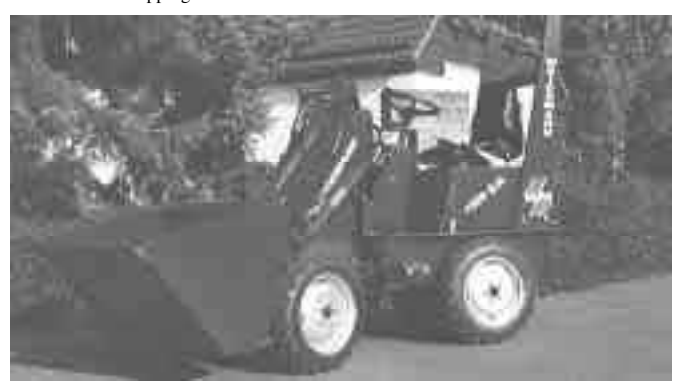
The Weidemann 1009 D/R is powered by a Mitsubishi 3-cyl. 20 hp diesel engine. It's shown here equipped with a 14 cu. ft. bucket.

Contact: FARM SHOW Followup, GK Machine, 10590 Donald Rd. NE, P.O. Box 427, Donald, Ore. 97020-0427 (ph 503 678-5525: fax 5693).