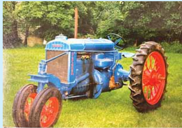
Blue 1937 All-Around, before (below) and after (left).

trees. All of the nuts and bolts were missing. A friend and I hauled it home in two pickups."