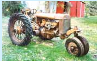
Orange 1938 All-Around, before (above) and after (below).

Bosch says, "The owner's son had disassembled it for a school project, then brought it home in pieces. There were parts in a barn, a chicken house, a garage and in a grove of