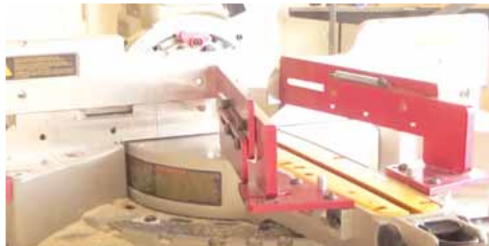
"With these tools, the left hand starts the cut, but before it enters the danger zone, it's out of the picture," says Niichel. "The right hand is always the pusher but never enters the danger zone."

Contact: FARM SHOW Followup, NightBuddy (www.nightbuddy.co; Facebook: Night Buddy; Instagram: nightbuddy.co).