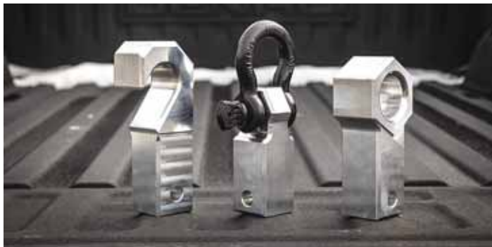
"I've pulled out a few things now with the Shackles. No more breaking straps," says McAllister.