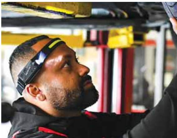
Instead of a single bulb, the NightBuddy uses an LED strip to create its expanded lighting.

Contact: FARM SHOW Followup, Weigh Safe, 420 N. Geneva Rd., Lindon, Utah 84042 (ph 801-820-7020; customersupport@weigh-safe.com; www.weigh-safe.com).