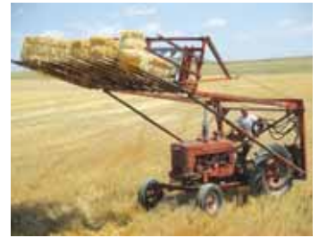
The Ranch Hand was a self-propelled version of an F-10 loader. This survivor was sold at a Montana auction in 2020.

ideas over 25 years, producing Hy Dump boxes, wheel rakes, a bale accumulator, self-unloading forage boxes, grinder mixers, sugar beet equipment, tillage equipment, silage blowers, big bale movers, tub grinders, pull-type hay stackers, and a grain processor. That diversity helped lead to their downfall, as did passing on others. For example, in the early 50's and 60's they declined to produce what became the Melroe Bobcat, the New Holland self-propelled bale wagon, and the very first large round baler.