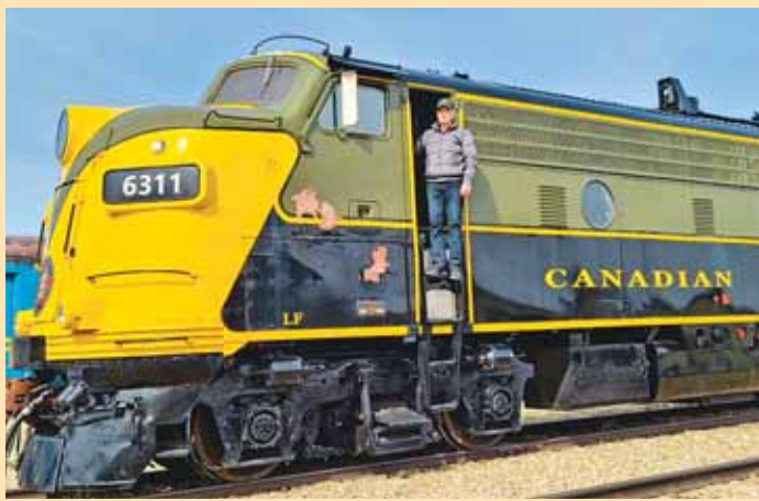
Gary Southgate stands in the doorway of engine 6311 which pulled passenger cars for CN Rail on the Super Continental more than 50 years ago. The engine and several cars are repainted in classic CN colors.