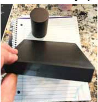
Nitrophyl is resistant to gasoline, diesel, LP and automotive oils, such as power steering fluid, motor oil and various chemicals and solvents.

He offers rectangular and round blocks of the material. He has priced 3 by 3 by 1-in. thick blocks and 2-in. diameter by 3-in. long round blocks at $20. A 6 by 6 by 1-in. thick