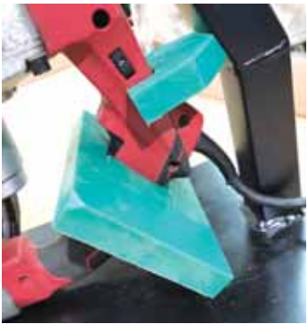
High-density polyethylene holding the trigger in the on position.

position. When I want to shut the saw off, it's easy to pull out."