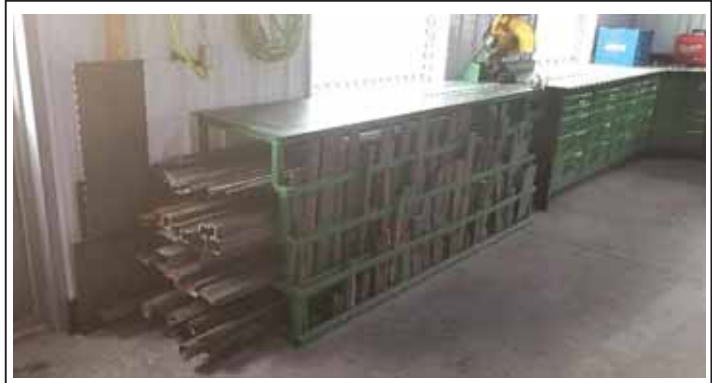
Welding table has metal storage below, a cut-off saw and is 10-ft. long.

Palomanes adds that staying on top of new components and models is a challenge.