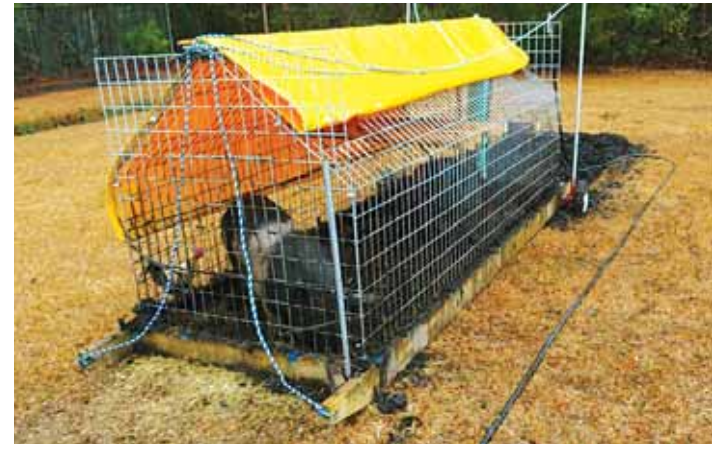
Walden's movable "pig till" pen is easily moved by a rope pull at one end.

reflective light from pinwheels to deter predators and keep chickens