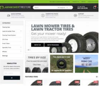
Lawn Mower Tire Store's website has sales personnel who can walk you through the process of ordering tires.

The Lawn Mower Tire Store website provides guidelines and stories/tips for