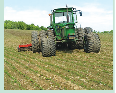
Forde cultivates newly emerged crop at a 45 degree angle using a rotary hoe with the hoe wheels turned backward.