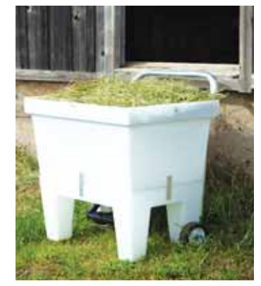
The Hay Soaker holds about half of a small square hay bale and can also be used to soak beet pulp and hay cubes.

Available direct from the company, the Hay Soaker is priced at $1,599 plus shipping, which is handled by UPS to a physical address.