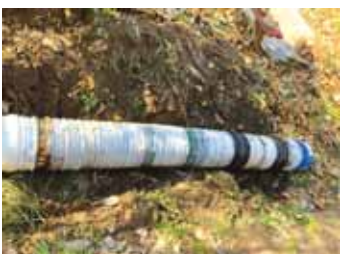
5-gal. buckets with the bottoms removed are stacked together to create a heavyduty pipe.

Carl Stoloski, Appleton, N.Y. (sstoloski@ sbcglobal.net).