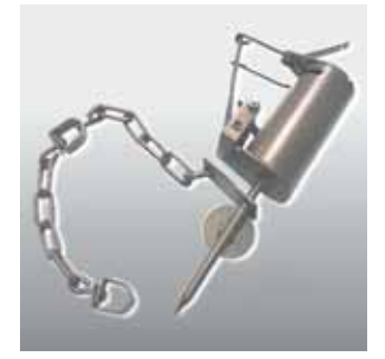
Dog-proof raccoon traps by Ztraps are designed so that a dog can't accidentally spring the trap.

Ztraps also offers a trap that looks like a tube. The tubes have bait inside them, so the animal crawls in after it, and the door shuts behind them.