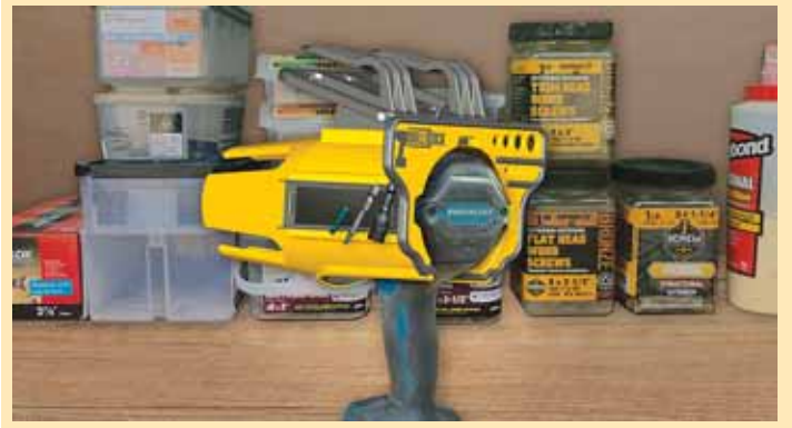
Drill Dock can be moved from shelf to bucket, to ladder or lift and has a place for bits and has an included bit gauge.