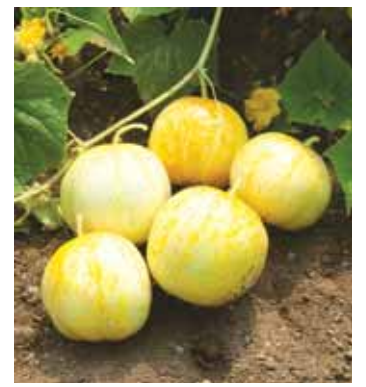
Lemon cucumbers have a yellow color and round shape with a mild, sweet flavor and cool, crispy texture.

Growing them is similar to other cucumber varieties. Plant seeds 36 to 60-in. apart on hills in well-drained soil in a sunny location. Keep the soil moist, at least an inch/week.