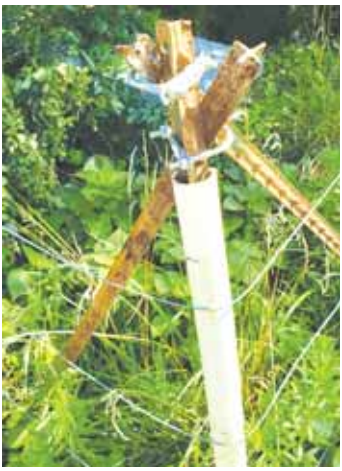
U-Bolts are used to attach brace posts at an angle making a secure corner post.

Contact: FARM SHOW Followup, Sam Powell, Hagerstown, Md. (ph 301 491-3046).