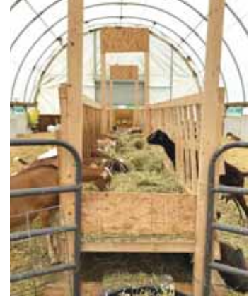
Prairie Fruits Farms designed a high capacity goat feeder that can feed 60-70 goats at the same time.

Fruits Farm & Creamery, LLC, 4410 N. Lincoln Ave., Champaign, Ill. 61822 (www. prairiefruits.com).