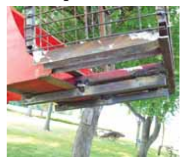
The cage can also be used with forks.

Negen made the sides of the safety cage and one end by cutting down a 16-ft. gate he once used to sort pigs. The gate had been built with 1-in. sq. steel tubing welded to 35-in.