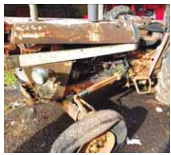
Before and after photos show Phillip Morris's restoration of a 1980 Case 1390.