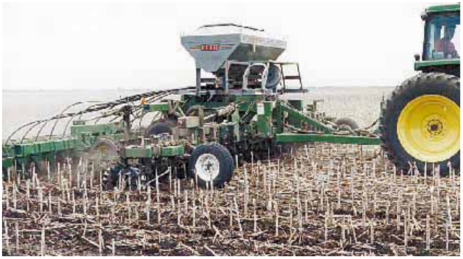
Hiniker air seeder unit mounts on Rawson coulter cart ahead of modified Max-Emerge planter.