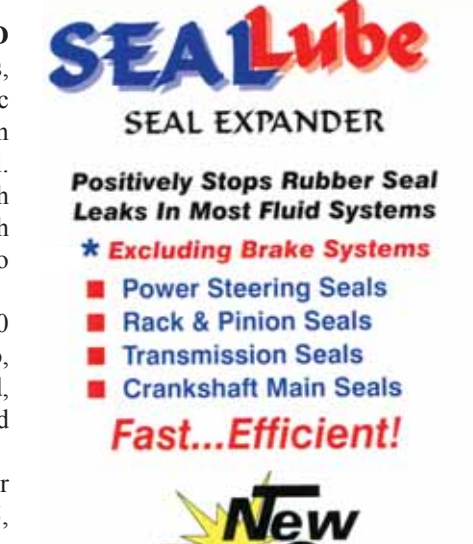
Reader Inquiry No. 128

Contact: FARM SHOW Followup or New Tech International , P. O. Box 3725, Centerline, Mich. 48015 (ph 800 434-9192; fax 586 758-6549; email: newt924@ netscape.net; website: www.seallube.com).