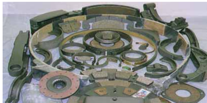
Photo shows examples of the type of relining jobs done by All Frictions Co.