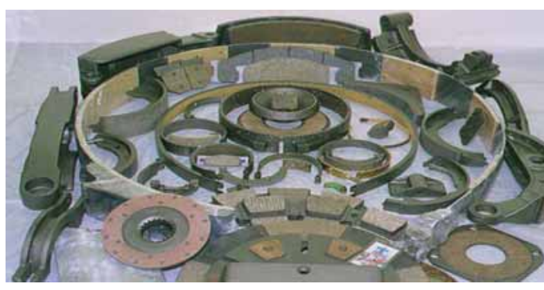
Photo shows examples of the type of relining jobs done by All Frictions Co.