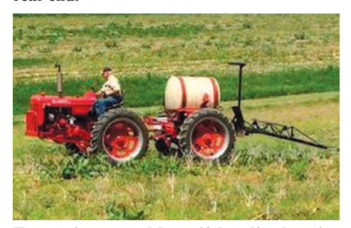
Tractor is powered by a 40 hp. diesel engine out of a junked Ford 3000 tractor. "Works great to spray corn and potato crops," says Davis.