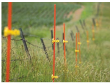
Fully adjustable military grade polymer with UV stabilizer support rings come in 8" 10" & 12" and snap onto 5-ft. steel Herringbone style rib posts that keep rings from rotating once you've locked them in place.

"In 40 years of gardening, I've never seen plant supports as versatile, simple to set up, easy to adapt and compact as the EZ Step Plant-Support System. A test trial of the system convinced my wife and I that this is the way we will go in coming years" says Jim Ruen , contributing editor at FARM SHOW (Vol. 44, No. 5, Pg. 15).