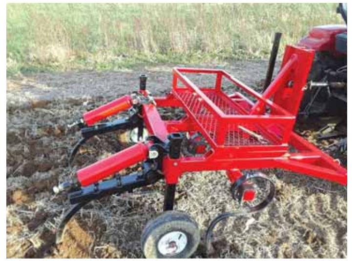
Chisel CR deep tillage tool has 2 rear shanks spaced 3 ft. apart, which dig the soil up to 14 in. deep.

Contact: FARM SHOW Followup, FarmBuilt LLC, 6991 Co. Rd. 219, Bellevue, Ohio 44811 (ph 419 271-4176; www. farmbuilt.net; farmbuilt@hotmail.com).