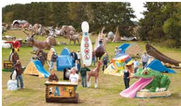
FAST Fiberglass designs and builds a wide variety of tourist attractions, everything from giant animals to big bowling pins and frog water slides.

Ordering a custom statue is simple. Webber describes starting with as little as a verbal description. “We definitely like to make a computer model to begin with,” he says. “That can run from $500 to $1,000. The price of a final statue is based on size. A rough estimate would be about $2,000 per foot of the longest dimension. However, final price