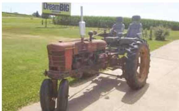
He fitted this Farmall H with 2 leather middle seats out of an Oldsmobile Silhouette minivan.