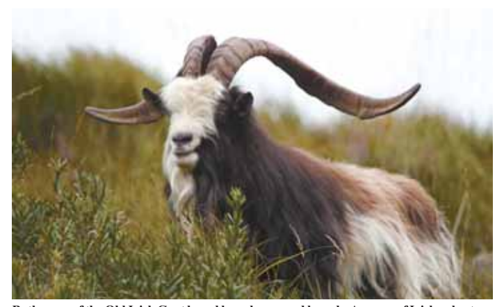
Both sexes of the Old Irish Goat breed have horns and beards. A group of Irish volunteers are trying to increase their numbers.

Contact: FARM SHOW Followup, Chad Wegener, 6902 S. 240th St., Gretna, Neb. 68028 (ph 402 510-2408; chad@ willowvalleyfarms.org).