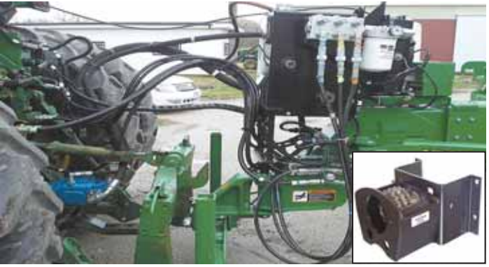
Pto-powered HydraBoost pump is designed to meet the needs of new planters and other hydraulic power hogs. PumpDoctor bracket, lower right, secures pto pump to reduce vibration.

Contact: FARM SHOW Followup, SIB Services, Whynieton, Maud, Peterhead AB425SA, United Kingdom (www.sibservices.co.uk).