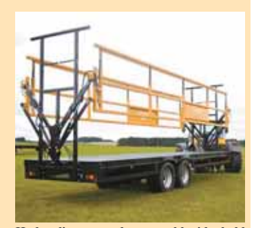
Hydraulic-operated, retractable sides hold bales in place.

People from the U.S., France, Iceland and Germany have contacted the brothers after seeing the trailer in a YouTube video. A