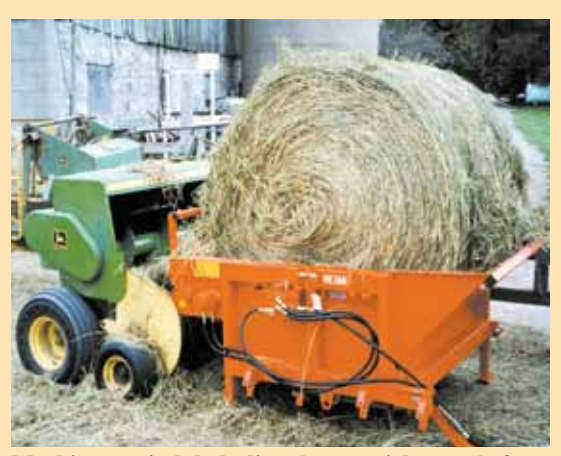
Machine unwinds bale directly over pickup reel of any small square baler. You can see a video of the Altec bale unwinder at our YouTube channel: "thestgeorgeco".

Contact: The St. George Company Limited, P.O. Box 430, 20 Consolidated Drive, Paris, Ontario, Canada N3L 3T5 (ph 800-461-4299; fax 519-442-7191; email: sales@thestgeorgeco.com; website: www.thestgeorgeco.com).