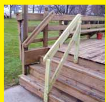
I needed a second handrail on the stairs leading up to our deck so that my wife, a stroke patient, could get up or down the 3 steps. Both sides of the handrail have a 1 1/2-in. wide, 3/8-in. deep recessed finger groove in them. The 2 handrails are about 3 ft. high and 28 in. apart.

plants 6 ft. tall. I got tons of produce off them. I'm thinking the grass clippings and leaves really made the difference, but I'm not sure. My neighbors are putting their clippings on their gardens now, too. (Joel Argersinger, Toledo, Ohio)