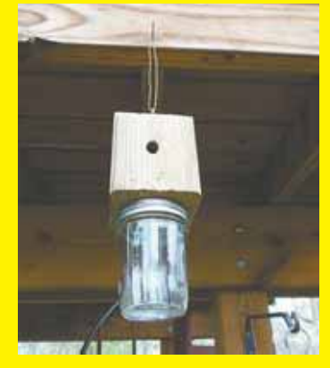
My dad and I built a 4-sided carpenter bee trap by screwing a canning jar to the bottom of a box made from 7-in. long pieces of wood. We drilled 1/2-in. holes into all sides of the box at an upward 45-degree angle, which prevents direct sunlight from shining in. We also drilled a 1-in. hole in the bottom of the box and screwed the jar on over it. The box hangs from a wire attached to our barn.

"I built an open-front 10 by 13-ft. woodshed around the stove, with the burner sticking out the back. Wood is stored around the stove. A motion light comes on when it's dark outside and I have to feed the boiler. (Richard Mountcastle, Rockville, Ind.)