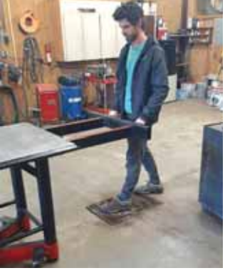
Rolling work bench rides on 4 caster wheels that are lowered to the floor with a footoperated jack. The table can be quickly lengthened to work on longer objects by pulling out an extension at one end.