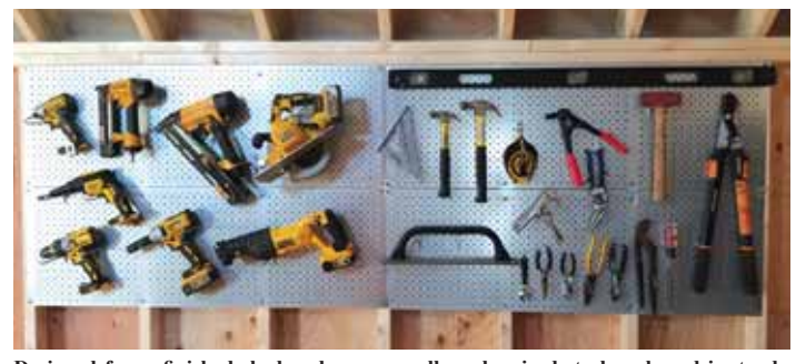
Designed for unfinished shed and garage walls, galvanized steel pegboard is sturdy enough to hang heavy tools.

Raytec does not sell directly to customers,